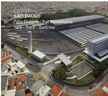
SÃO PAULO Pátio Oratório / Rail Maintenance Yard - Track - Switches

In the development of projects whose volume and urban insertion demands the development of environmental mitigation projects and landscape design, our company coordinates the development of these complementary studies involving experts in architecture and urban planning, landscape architecture, environmental engineering.