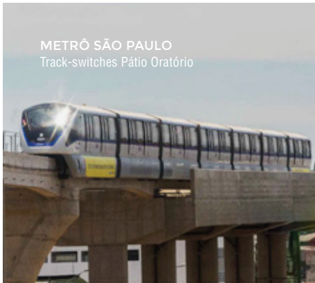
METRÔ SÃO PAULO Track-switches Pátio Oratório