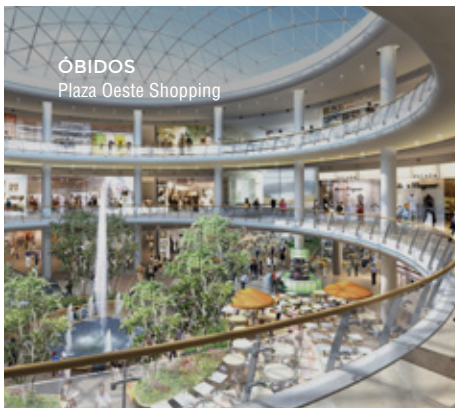
ÓBIDOS Plaza Oeste Shopping

Our aim is to provide full scope projects for Intermodal Stations where NSE develops the Structural Design and Geotechnical Investigation, and also promotes and coordinates the integration of other specialties, teaming with proficient and qualified consultants from complementary areas of expertise.