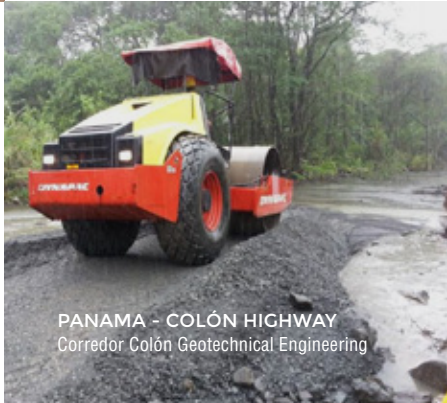
PANAMA - COLÓN HIGHWAY Corredor Colón Geotechnical Engineering

All the projects are evaluated through different perspectives, incorporating the geotechnical component seamlessly, always looking for solutions that harmonize with the terrain, with gains in safety, reliability, economy and durability.