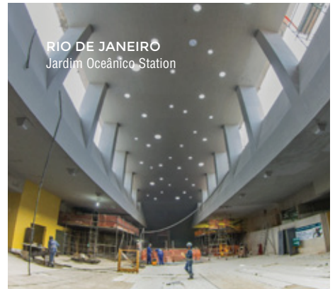
RIO DE JANEIRO Jardim Oceânico Station

Bridge Design is one of the main fields of expertise of our company, following 30 years' experience of its key personnel. Our projects include state-of-the-art solutions, including dynamic studies, soil-structure and soil-structure-vehicle interaction studies and designing temporary works, construction phasing definition and on-site technical assistance.