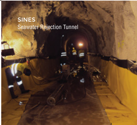
SINES Seawater Rejection Tunnel

In partnership with hydraulics specialists, NSE works in the design of hydraulic tunnels, Underground Works and other Concrete Structures - Reservoirs, Dams ranging from small, hydroelectric production facilities to large scale developments, pumping and treatment facilities, spillways and water intake towers.